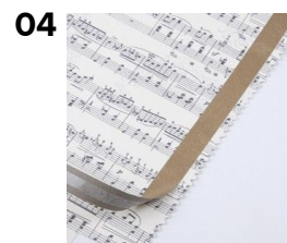
04 Fasten the strip on a piece of Music Notes Card.