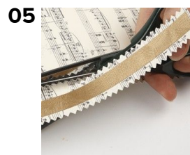
05 Cut out with Kidzors Paper Edger Scissors.