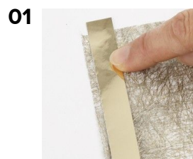
01 Fasten a strip of gold metallic paper onto a piece of fibre paper and cut out.

Kori on taitettu kultapaperista, koristeluun on käytetty mulperipaperia ja nuottipaperia. Aloita taittamalla korin pohja. Katso ohje tästä