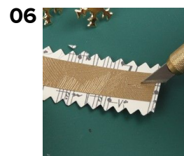
06 Make a hole in each end of the strip.