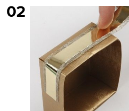
02 Attach it to the box with double-sided adhesive tape.