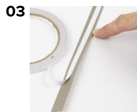
03 Attach double-sided adhesive tape on the back of a Weaving Paper Strip.