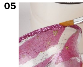
05 Decorate with glitter (use glass decoupage to paste it on.)