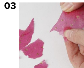
03 Tear the silk paper in to small pieces.