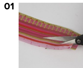
01 Cut out lanes from the silk paper