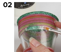
02 Paste on paper and glitter using glass decoupage.