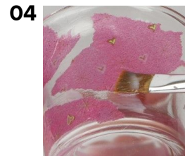
04 Paste it on the glass with glass decoupage.