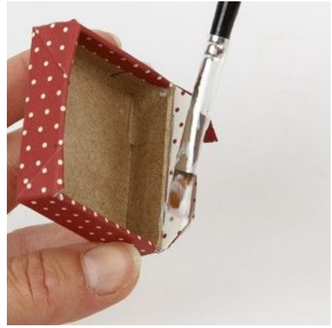
8 Apply glue to the flap.