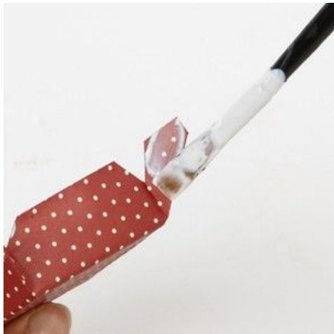
9 And in the corners.