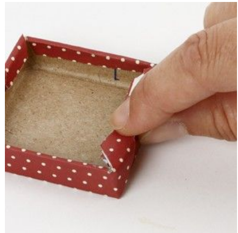
10 Fold around the edge.